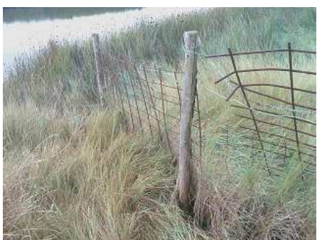
Magnetic nano behind this post.