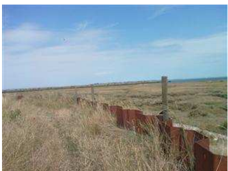
Magnetic nano between (now only) post and iron wall.