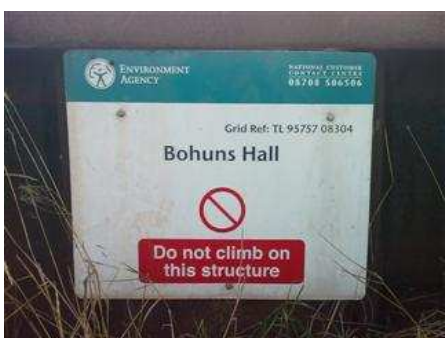
The magnetic nano is middle left behind the sign.