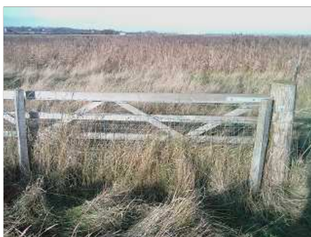
Magnetic nano at bottom right hinge of gate.