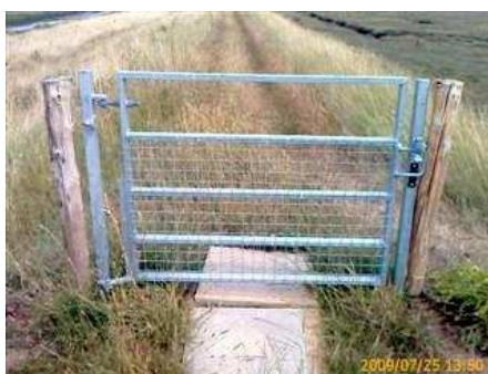
Magnetic nano under bottom left hinge.