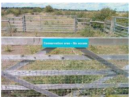
Magnetic nano at bottom of gate on left hand side.