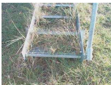
Magnetic nano at the bottom of the staircase.