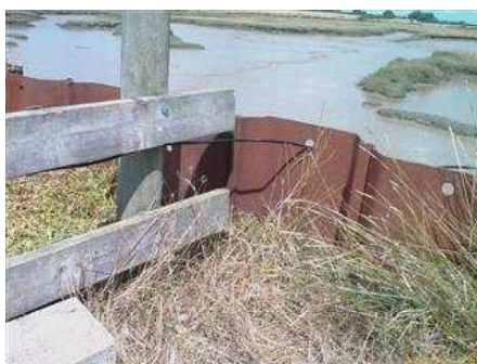
Magnetic nano under the step up to the stile. In a small plastic bag.